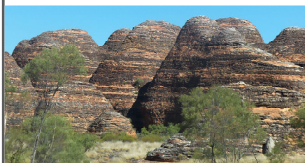
Isn't God's creation beautiful? The "Bungle-Bungles"

SMBG in Barunga! Please pray for us as we plan and carry out the workshop to be held here at the Barunga church, around November 3-12.