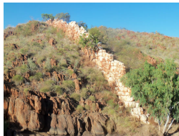
While in Halls Creek, we saw the "mini China wall!"